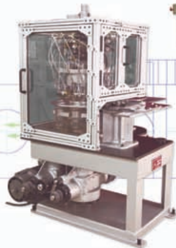
4 Apex-Swangren RCS: High-speed, smooth, continuous rotary compound pouring; 800 cpm for most sizes; electronic chuck speed and fine dispense adjustments; electronic cap presence; vacuum-capable.