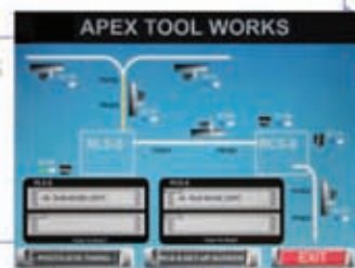
3 Touch-screen PLC control: Intuitive with sharp, clear graphics; easy set-up and monitoring.