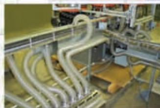
1 Stainless pneumatic conveyor: High-speed; food grade stainless steel; accommodates compact footprint.

From Apex Tool Works, Inc., a world-leader in container-end tooling, machinery and systems.